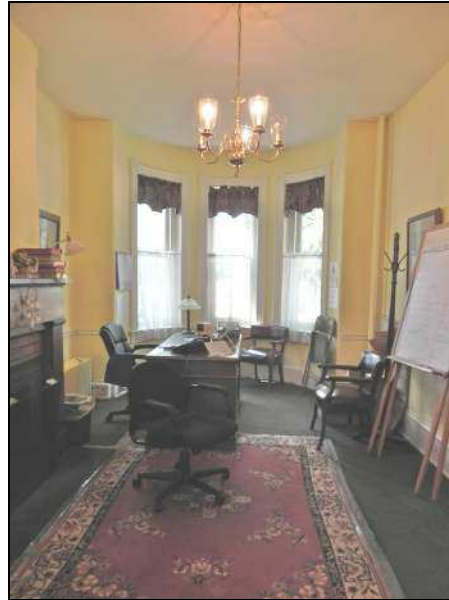
Penniman Room, Baxter House