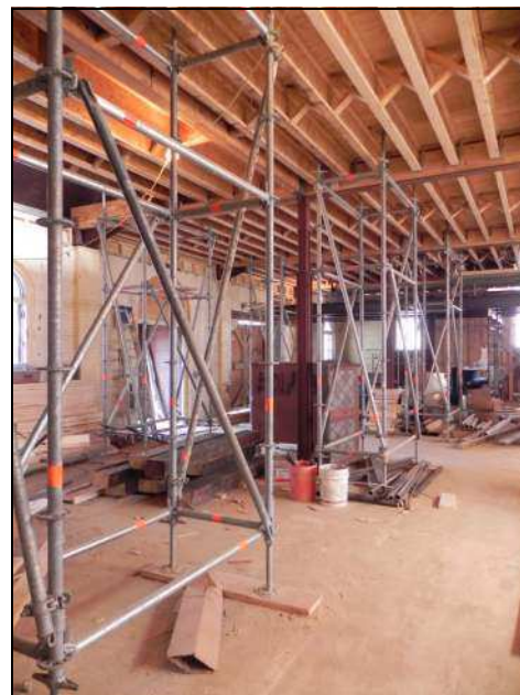
Baxter Hall with the new ceiling/office floor in place