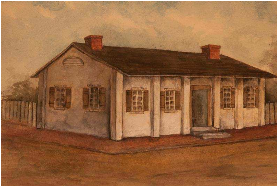
The Market House which stood on the corner of 3rd & A St., SE, where the nave of St. Mark's now stands

The Search: Upon completion of the parish profile, the DSC will transition into the quiet phase of our work during which we will officially post the job announcement for our next rector, review applications, interview candidates, and, ultimately, make a recommendation to the Vestry.