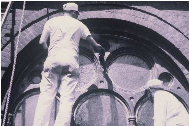
Work being done on the nave windows, 1970's