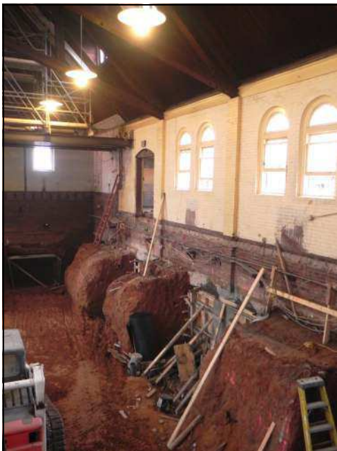
The 'Big Dig' ....now houses 3 new classrooms, the Choir room & library, a lounge, & new restrooms